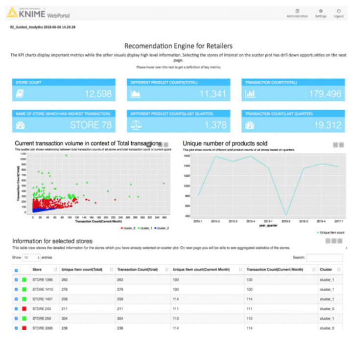
Fig. 1: Recommendation engine displayed in the KNIME WebPortal.